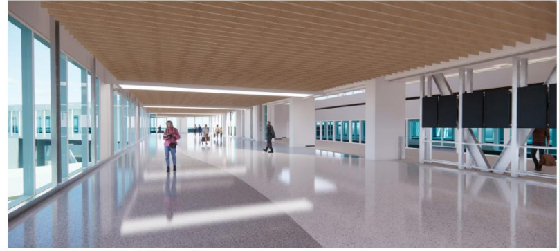
Terminal Connector and South Walkway Entry