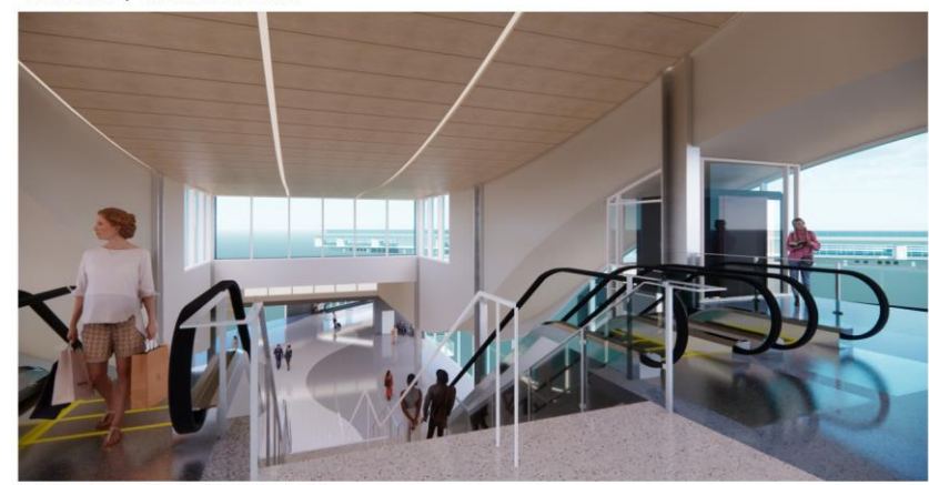
Central Space of Vertical Circulation Hub